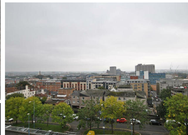
Carolina House Dove Street, Bristol ,